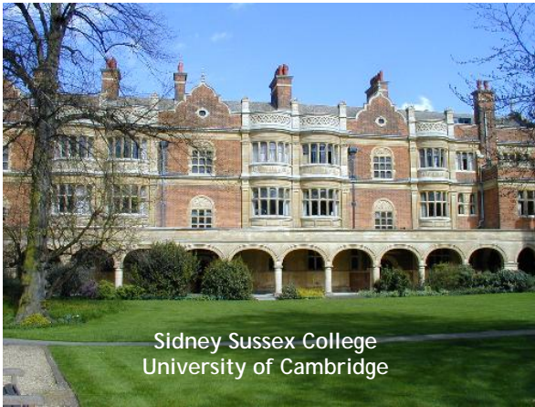
Sidney Sussex College University of Cambridge